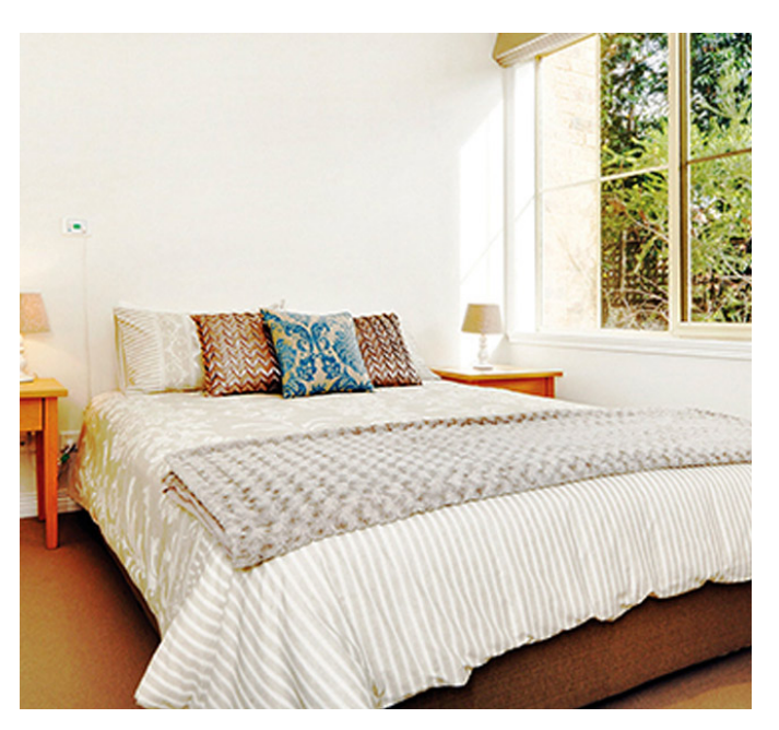
Studio Room Cost