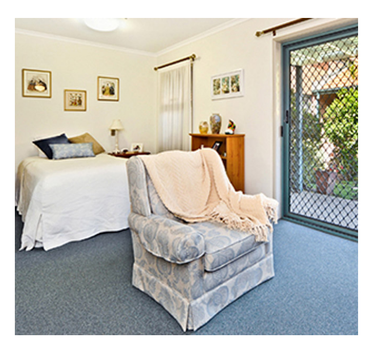
Single Room - Large Room Cost $550,000