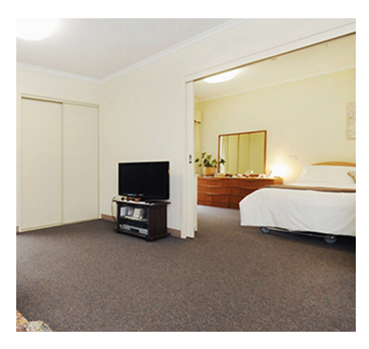
Couples Room Room Cost $320,000

Services and support designed to optimise your health and wellbeing.